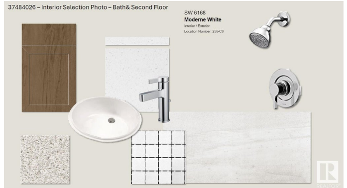
SW 6168 Moderne White Interior / Exterior Location Number: 238-C9