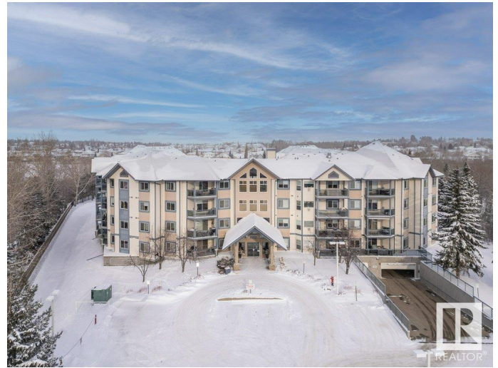
414-100 Foxhaven Dr, Sherwood Park, AB